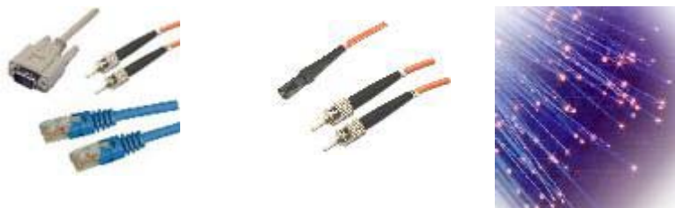
CABLES & CONNECTORS